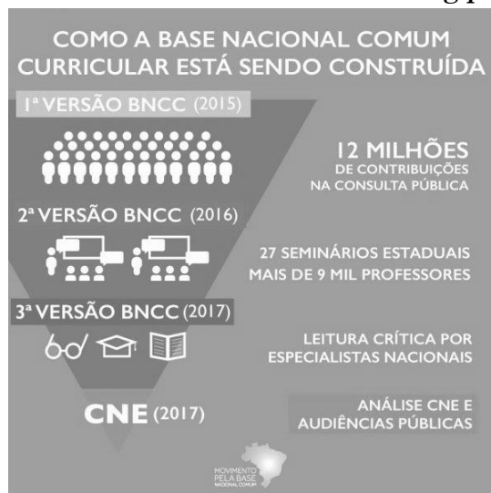
Figure 1 – BNCC assessment and writing process