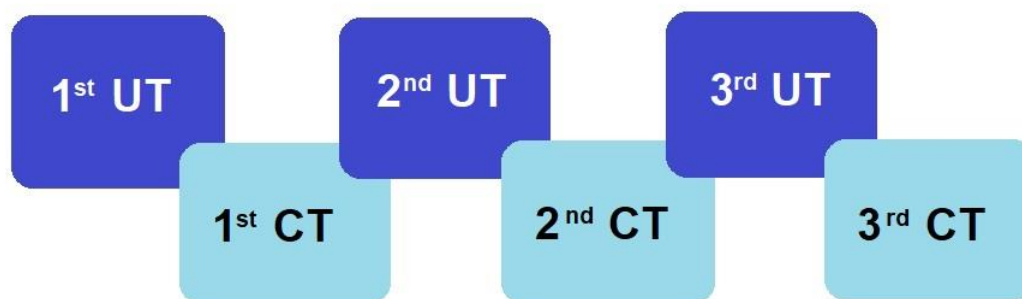
Figure 1 - Semiannual alternation regime at LEDOC/UFRGS

Regarding alternation, the student experiences moments at the university, called University Times (UT), and moments in the community, designated as Community Times (CT), as shown in Figure 1, below.