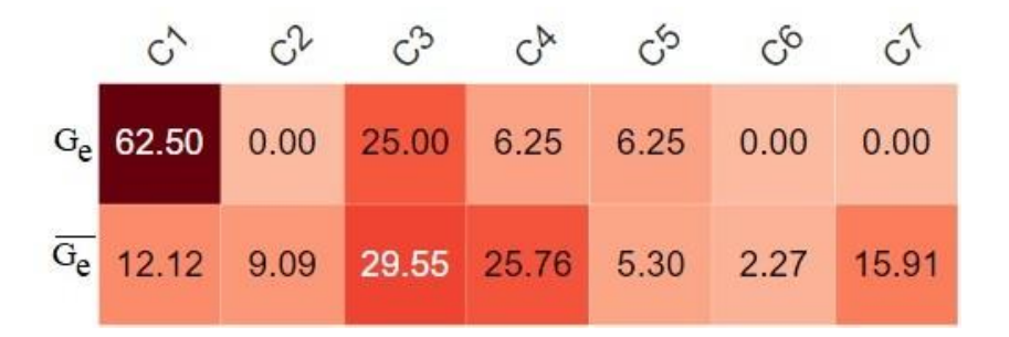
Figure 4 - Heat map of the distribution of terms by categories between the groups Ge and Ge.

The ratio between the arithmetic mean of the category terms per individual in G_e and G_e and the total of terms searched to identify search behaviors between groups were calculated. It is possible to observe in Figure 4 that participants from G_e performed more frequently searches that allow access to more reliable information (category C1). Basic information such as treatment, prevention and historical information was little sought by this group, which denotes a previous knowledge of the participants of the group of specialists in the health area. The group G_e , in turn, did not seek much for information from official bodies and there was a greater number of searches, compared to the previous group, for historical, preventive and statistical information.