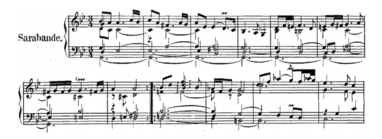
Figure 2: Sarabande in G minor, English Suite No. 3, mm. 1-12. Suggested preparatory piece for the Prelude in Eb minor, WTC I .

2, is more commonly found in less advanced pieces; therefore, students are more familiar with this notation than with the one in the prelude (3/2 meter). Besides, this sarabande has the same type of chordal texture of the Prelude in Eb minor , which would also help to clarify the concept of the dance. In this case, emphasis on beats are achieved through longer note values on the second beat of most measures as well as ornamentation – trills and arpeggios.