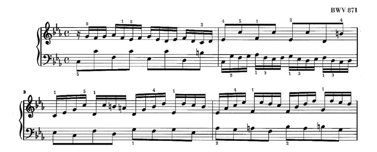
Figure 9: Prelude in C minor, WTC II, mm. 1-4. This prelude presents characteristics of a two-part invention.

It would be good for the student to be familiar with some of the two-part inventions. Invention No. 4 in D minor would be a great preparation for this prelude since it involves the same type of rotation between wider intervals and the exchange of material between hands in a shorter piece, as demonstrated in figure 10.