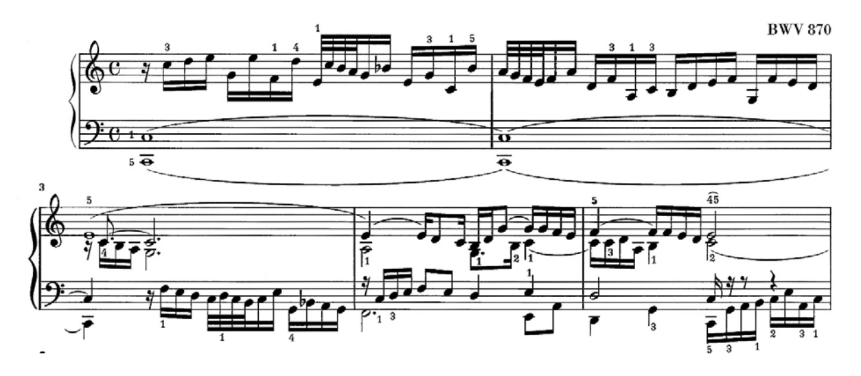
Figure 7: Prelude in C major, WTC II, mm. 1-5. It presents free contrapuntal style.

The Prelude in C major from Book 2 is also written in the same free-improvisatory style, almost like an unmeasured prelude. The rhythms Bach writes right in the opening, measures 1-5 of figure 7, not repeated in patterns, suggest an attempt to notate, with measures, a free and improvisatory piece of music. This prelude is much more complex than the C major from Book 1, with contrapuntal writing that needs to be carefully addressed and practiced with each hand separately and with a clear idea of where the many overlapping phrases begin and end.