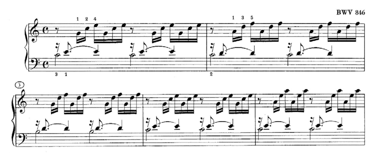
Figure 6: Prelude in C major, WTC I, mm.1-5. This prelude presents a free and improvisatory style.

The famous Prelude No. 1 in C major, Book 1 , is a good example of a free, improvisatory style, a literal "prelude." This piece relates to the origin of the early prelude, working as a piece or "something" that you play to warm up your fingers, try out the instrument, its tone quality, and tuning.