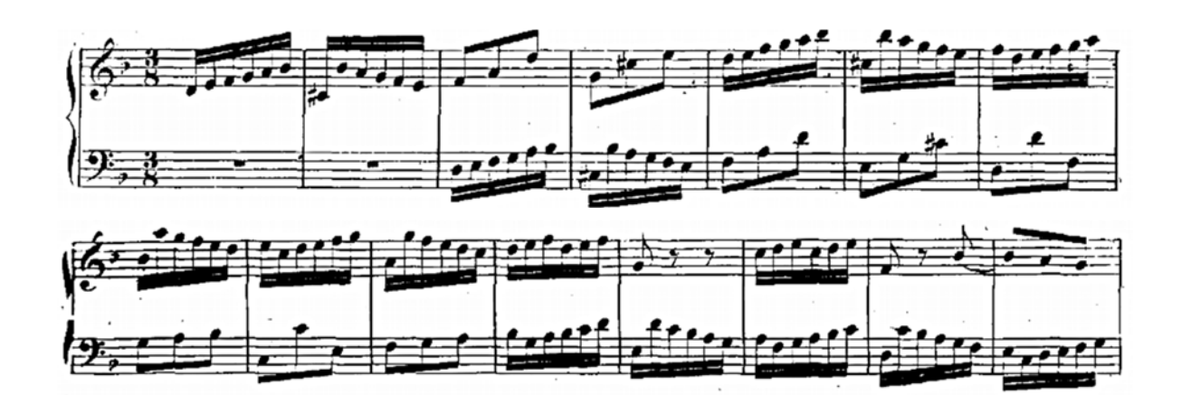
Figure 10: Two-part invention No. 4 in D minor , mm. 1-15. Suggested piece as preparation for the Prelude in C minor , WTC II .

It would be good for the student to be familiar with some of the two-part inventions. Invention No. 4 in D minor would be a great preparation for this prelude since it involves the same type of rotation between wider intervals and the exchange of material between hands in a shorter piece, as demonstrated in figure 10.