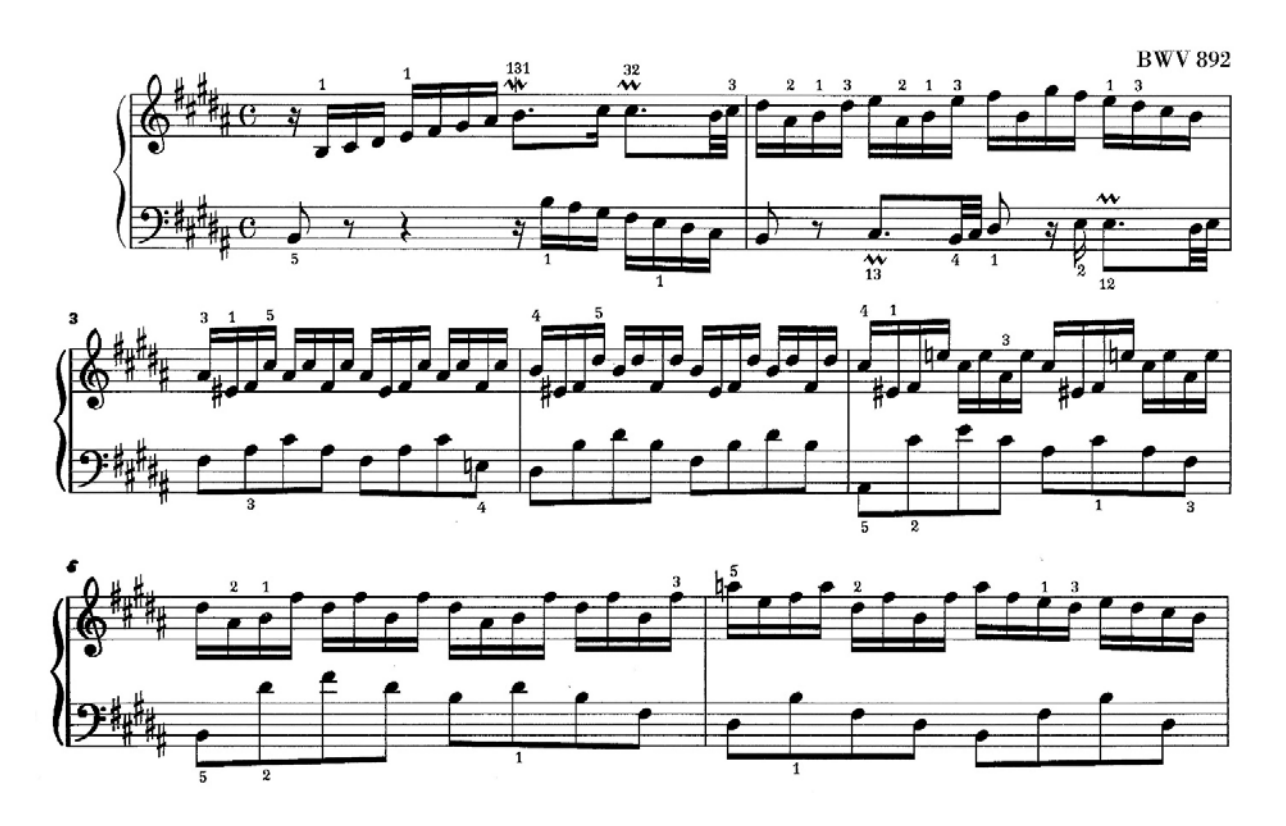
Figure 11a: Prelude in B major, WTC II, mm. 1-7. Concerto-like prelude. Its opening measures suggest a tutti (mm. 1-2) and a soloist (mm. 3-7).

According to the great pianist and interpreter of Bach, Angela HEWITT (2002), the Prelude in B major from Book 2 sounds like a concerto. Its brilliant opening in the first two measures suggests a tutti followed by the soloist in measure 3. Later in the piece, measures 12-15 for instance (see figure 11b), it seems there are two soloists alternating with the tutti, perhaps a violin and a flute. This prelude has different sections, some sounding like little cadenzas in the middle of the concerto, others sounding like solos or tutti. The student should definitely take advantage of this aspect to create different colors and contrast within the piece.