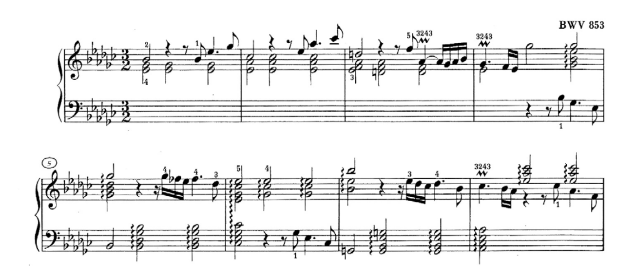
Figure 1: Prelude in Eb minor, WTC I, mm. 1-8. This prelude presents characteristics of a sarabande.

evoking a lute accompaniment. In a typical sarabande, the accentuation often happens on the second beat but can also happen on the first. In this case, the emphasis on the first beat is given through ornamentation in measure 4, arpeggiation in measures 5-7 and a combination of both in measure 8.