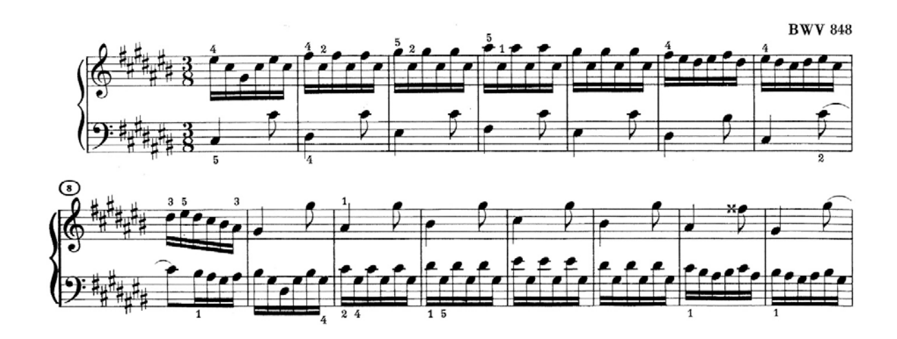
Figure 4: Prelude in C# major, WTC I, mm. 1-15. This prelude is giga II-like.

The Prelude in C# major , Book 1 , is like a gigue. It requires great independence in both hands since its material exchange between hands. Fast and light, there are no chordal passages in this piece, but a continuous stream of sixteenth notes. This particular one fits into the category of giga II described by LITTLE and JENNE (2001, p.168) as a piece typical of the instrumental style with joyful affect, long phrases, imitative texture and lack of cadences.