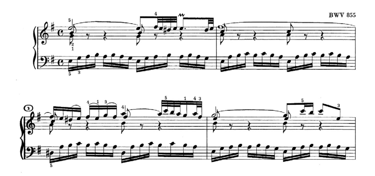
Figure 3: Prelude in E minor, WTC I, mm. 1-4. Presents characteristics of an aria.

The Prelude in C# major , Book 1 , is like a gigue. It requires great independence in both hands since its material exchange between hands. Fast and light, there are no chordal passages in this piece, but a continuous stream of sixteenth notes. This particular one fits into the category of giga II described by LITTLE and JENNE (2001, p.168) as a piece typical of the instrumental style with joyful affect, long phrases, imitative texture and lack of cadences.