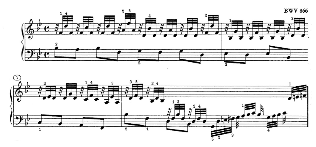
Figure 8a: Prelude in Bb major, WTC I, mm. 1-3. This prelude is toccata-like.

line is split between hands, and practicing each hand alone could create unwanted accents. Each group of four thirty-second notes, as in measures 1 though the second beat of measure 3 (see figure 8a), should be blocked in a way to help the student understand the harmony, seeing groups of notes instead of each note individually. After becoming comfortable with grouping, and more familiar with the notes, the student should be able to make decisions on how to shape this piece.