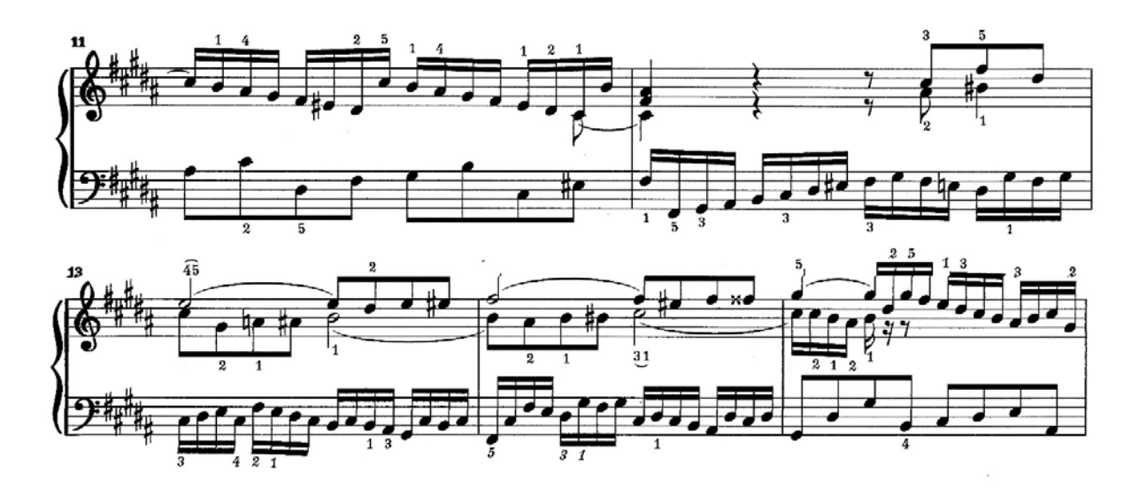
Figure 11b: Prelude in B major, WTC II , mm. 11-15. This specific passage shows a texture that could represent two soloists (in the upper voices).

Finding the different sections will enable the student to identify main differences in textures and patterns. Since this piece was written with many sequences, it is very important to find its main patterns. For instance, measures 3 is a model for measures 3-7 (see figure 11a) thus, practicing each measure and stopping on the downbeat of the next one is a good strategy. The cadenza-like passages (mm. 17-23) should be practiced with both hands as if they were being played by only one instrument. This is a very challenging prelude for its virtuoso character and constant flow of sixteenth notes in at least one of the hands, with the eventual addition of a third voice in measure 12.