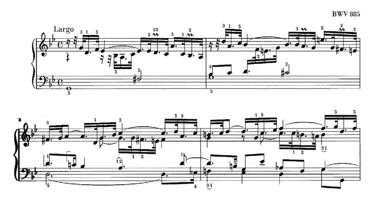
Figure 12: Prelude in G minor, WTC II, mm. 1-4. This prelude presents characteristics of the French overture style, characterized by the practice of double dots.