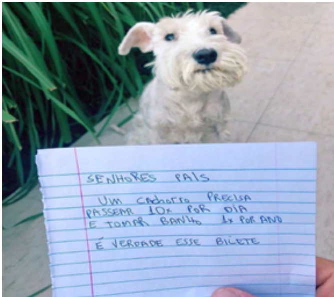
FIGURE 3 – Meme #2 7

From this note, several memes were viralized on the internet with different themes, but always with the catchphrase: ‘this note is true’. Therefore, we will analyze two memes constructed based on this context, one with a playful content and another that addresses a controversial issue of today. Next, we will see how the notions of texture manifest in the meme that there is bias towards entertainment and distraction, whose protagonist is a dog.