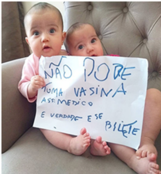
FIGURE 4 – Meme #3 8

In Figure 4, the visual mode presents babies sitting on a couch and holding a sheet of paper. Regarding the verbal mode, we notice inadequacies in relation to the standard variety, such as: toma, vasina, doctor, e, ese, bilette . Thus, on the provenance, the note indicates at the signature that this information was given by a doctor. However, looking at the visual textures evoked by the meme, we highlight the irregularities