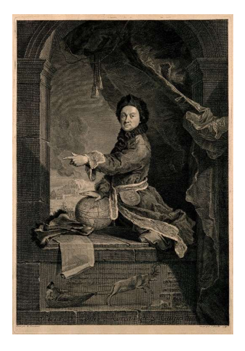
Fig. 3 Maupertuis shows the crushing of the earth with his left hand (engraving by J. Daul Wellcome)